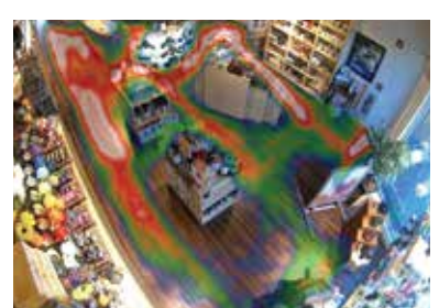
Visual Insights (Heatmaps)