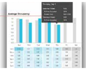
Dwelling / Occupancy Analysis