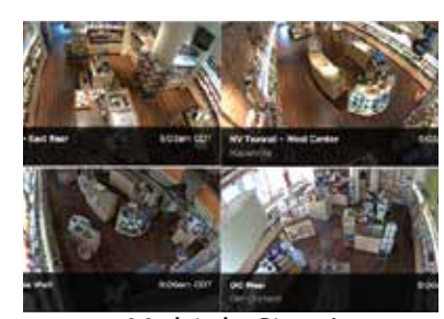
Multiple Sites/ Stores Comparison